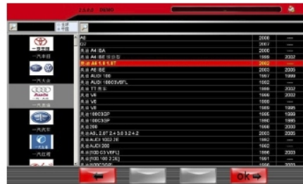
Car database interface :