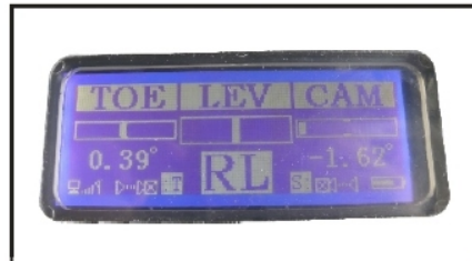
CCD sensor large display

New graphic design for customer understand to read current level situation.