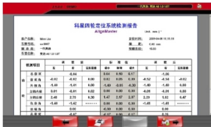
Customer management interface