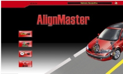
AlignMaster interface :